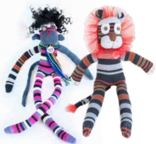
★ SOCK ANIMALS